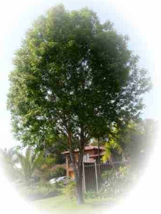
Our Season Tree